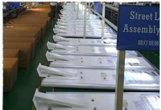
Finished product area